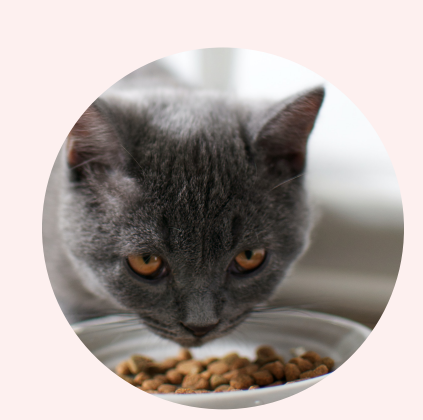
Invest in dog mats and feeding bowls