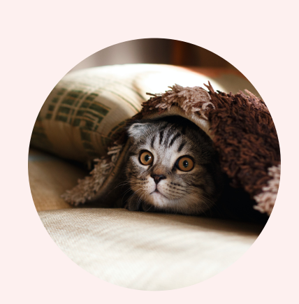
Use furniture covers

Here are some tips to pet proof furniture: